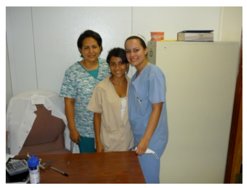
Dental Team: Senior dentist, dental assistant and new dental school graduate

Although the clinic is equipped with four dental operatories and a portable dental unit, the clinic employed two full-time dentists, one of which is a new university graduate